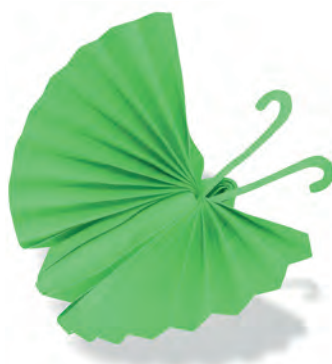
A butterfly was chosen for the 2000 launch of SeaQuantum to represent freedom of antifouling from TBT

market. Sharing and developing existing technology helps sharpen the competitive edge for SeaStar Alliance, enabling its partners to maintain their status as leaders in the marine market.